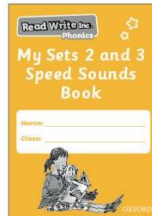
Practise reading and writing sounds in My Sets 2 and 3 Speed Sounds Book .

Ask your child to flick through the book and read the sounds as quickly as he or she can. If your child hesitates reading a sound, the picture is on the back as a reminder. Your child can also practise writing the sound on the same page.