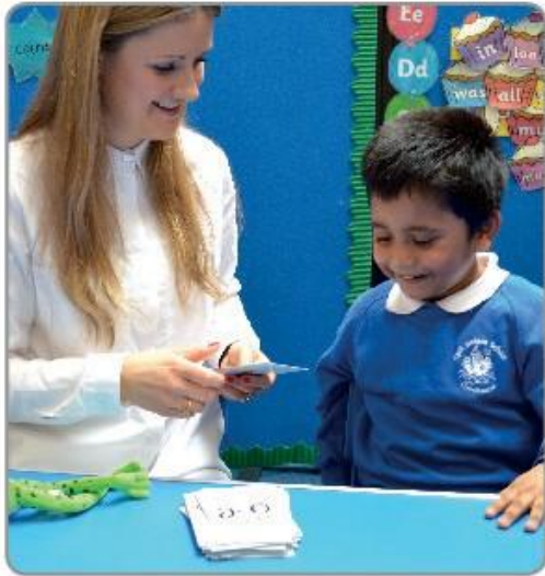
Learning the Speed Sounds in the classroom.